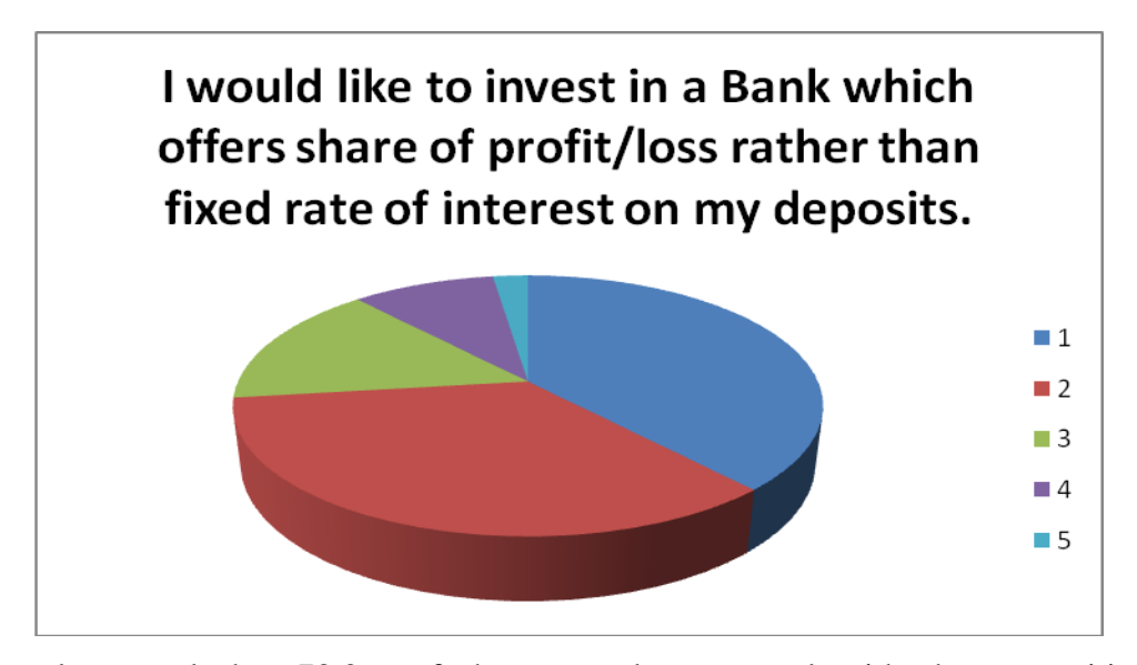
Table-2: I would like to invest in a Bank which offers share of profit/loss rather than fixed rate of interest on my deposits.

Results reveal that 73.0% of the respondents agreed with the proposition (Strongly Agree-38.16%; Agree-34.89%), 11.7% disagrees (Strongly Disagree-2.3%; Disagree-9.4%) and 15.3% were neutral. Thus, majority of the respondents are willing to make deposits in a bank which offers share of profit/loss rather than fixed rate of interest.