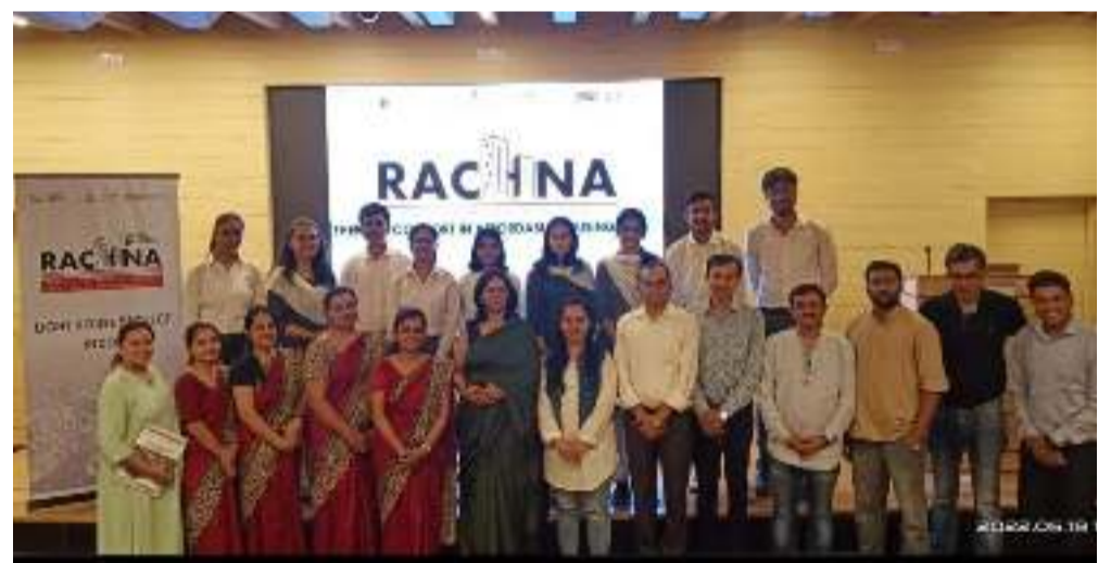
Architecture Dept., IPSA, hosted a 2- day event Under the Ministry of Housing and Urban affairs MoHUA to help students learn about the innovative construction technologies.