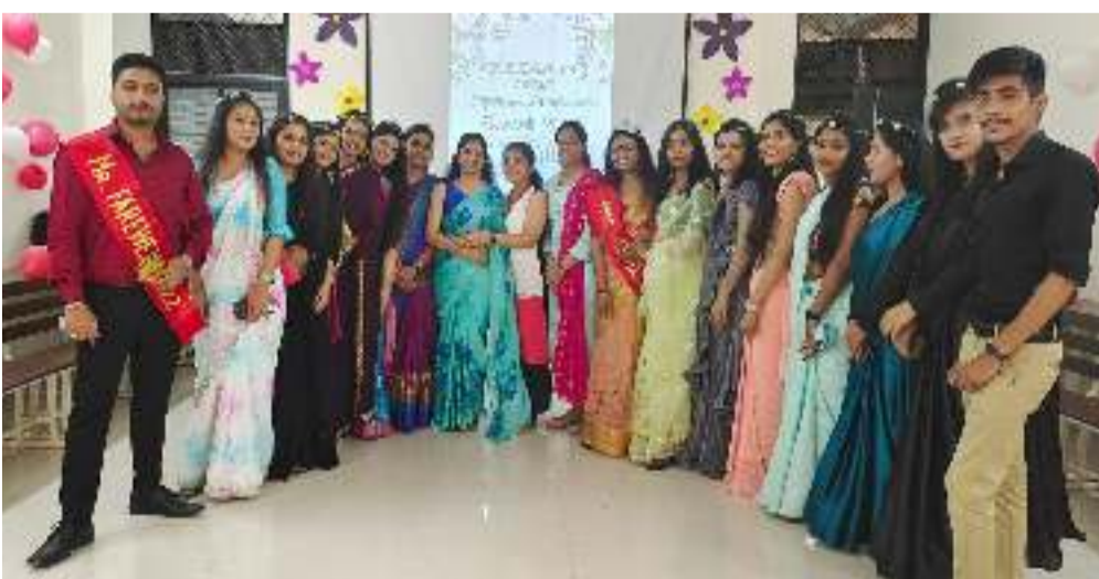
Farewell conducted for M.Sc. Students of Batch 2020-22