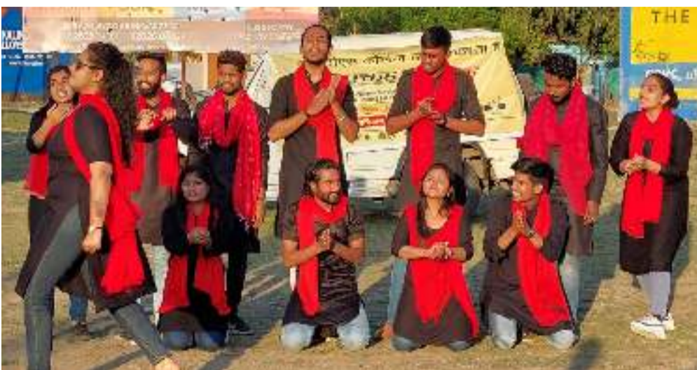
The department of NSS/IPSSR conducts nukkad natak on several topics to raise awareness in society at Sanwer local market.