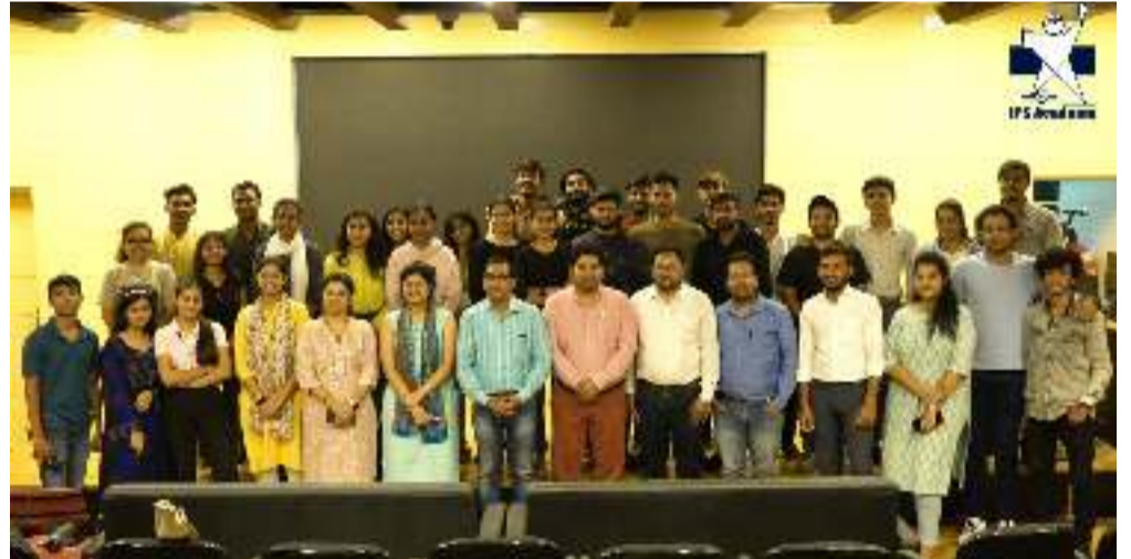
Audition for talent performers of the Academy for IPSA Radio 91.2FM