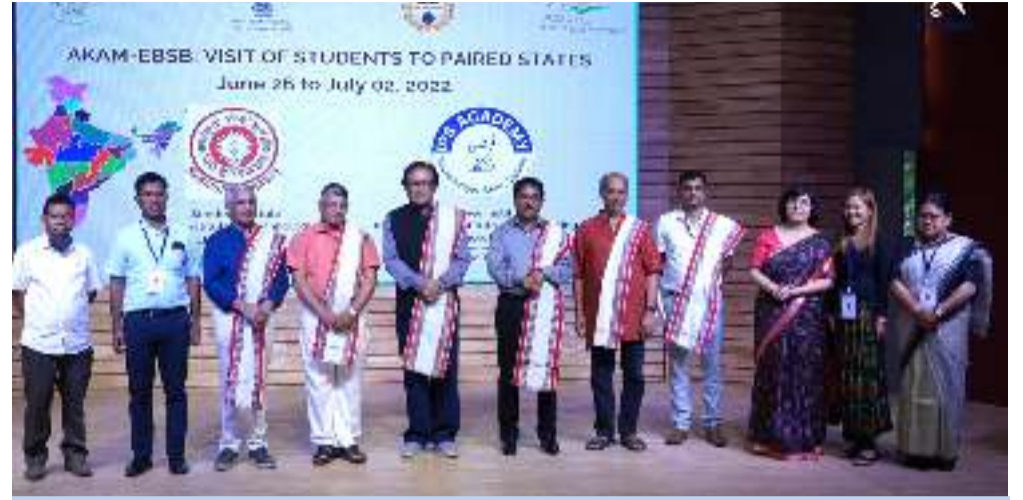
Students Exchange Program at Engineering Dept. Students from Manipur and Nagaland under the scheme "Ek Bharat Shrestha Bharat" (EBSB) visited IPSA