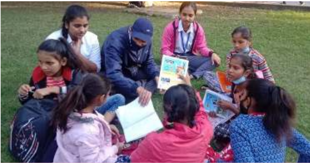
Gyan Vistar program at IPSA Academy by NSS/IPPSR department to teach the underprivileged children