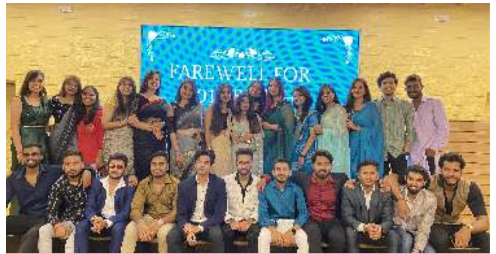
Farewell for 2022 batch conducted at Mass Communication Dept. IPSA Academy