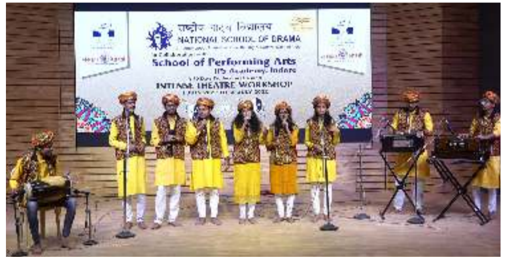
National School of Drama (NSD), New Delhi along with School Of Performing Arts, IPSA organized a 30 days production oriented Acting and Theatre Workshop from 1st-30th July 2022.