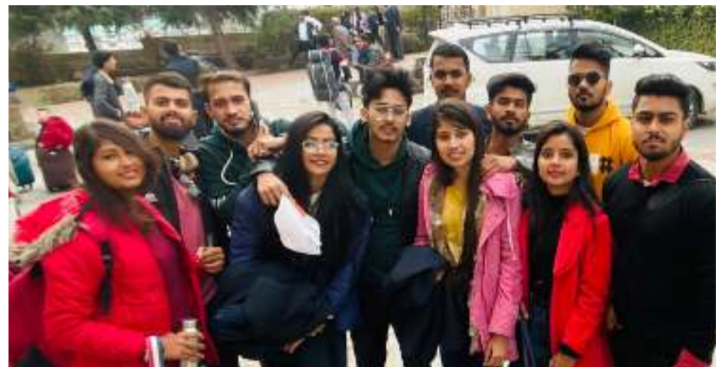
School of Travel and Tourism organized an Industrial Tour for 7 days for the students which covered Chandigarh, AmbalaCantt, Dalhousie, Khajjiar, Chamba, Dharamshala-Macleodganj, Amritsar- Wagha/Attari Border.