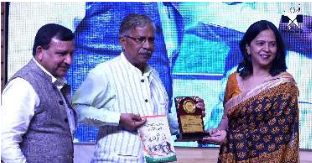
Award Ceremony hosted by School Of Architecture for National Level Architectural Design Competition for the Scientist's Memorial organized by #MPCST Bhopal