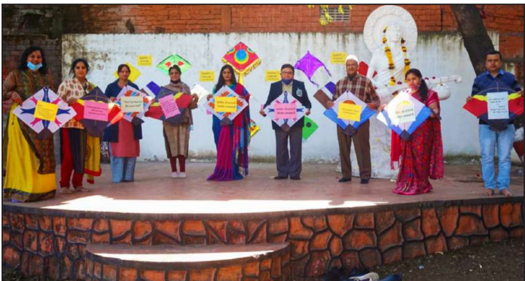
Kite festival celebrated at IPS academy.