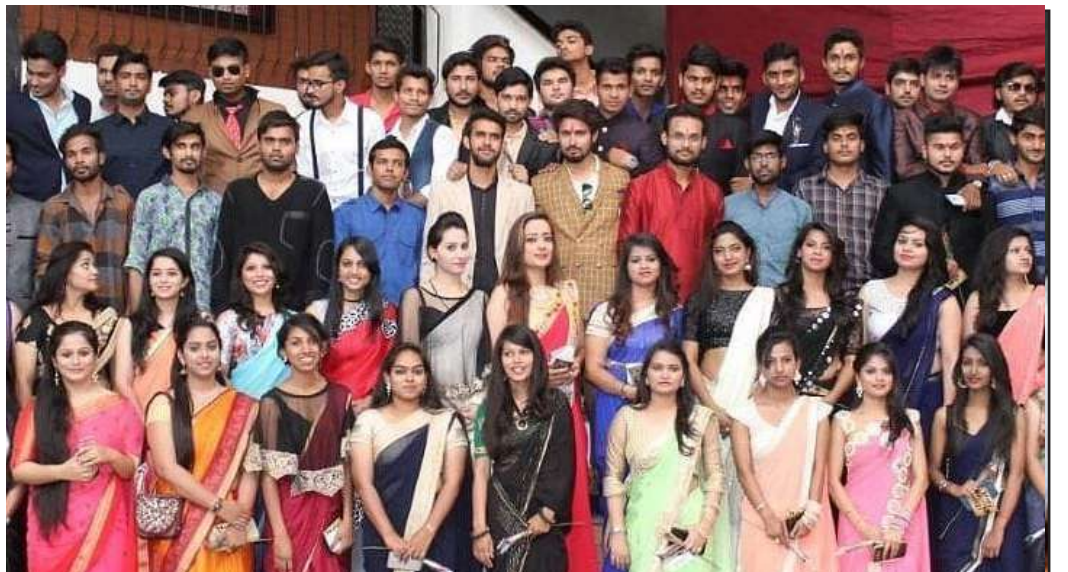
College of Commerce, IPSA organised an Alumni meet.