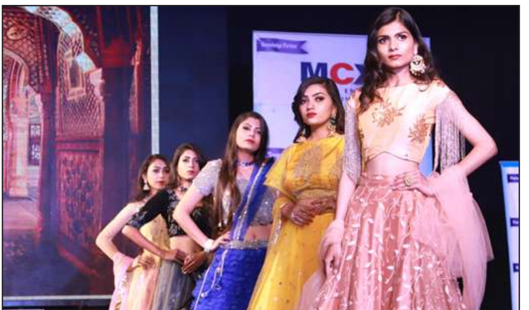
IPS Academy participated in the 76th International Conference of Textile Association on March 6th, 2021 at Ravindra Natya Grah, Indore. In this participation, Institute of Fashion Technology performed "VIBES" Fashion Show.