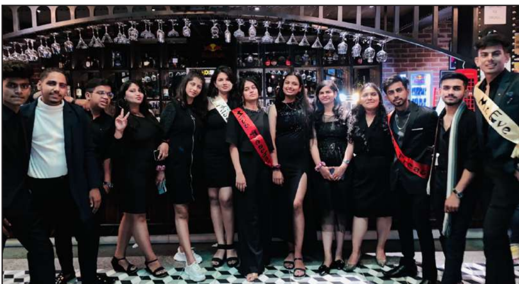
BAMC freshers event at Shosha, Indore.