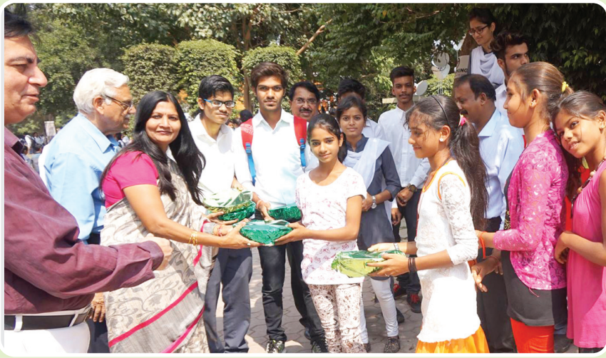
PCSR - IPS Academy celebrated Deepawali with underprivileged children.