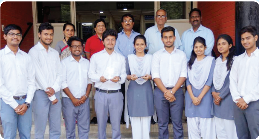
Students from School of Architecture awarded with two trophies from NASA (National Association Student of Architecture). These students were felicitated by the Management, IPS Academy and the Principal, School of Architecture as seen in the picture.