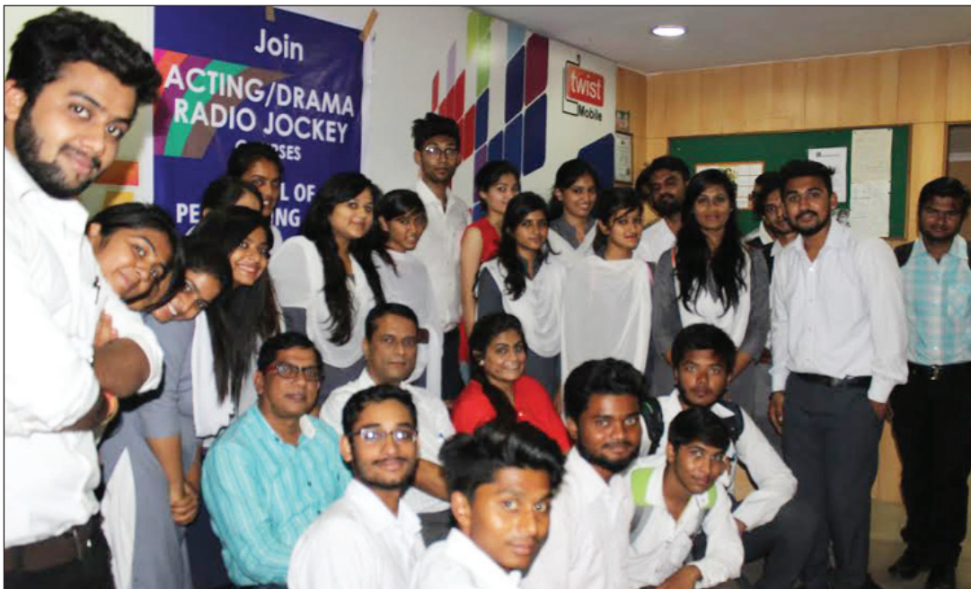
Students of mass comm at IPSA studio for practical training.