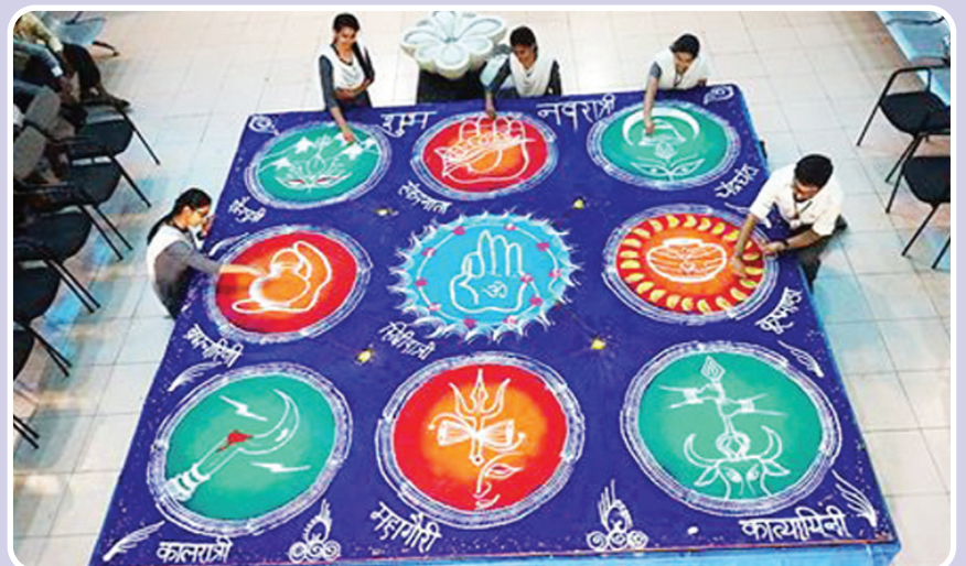
Beautiful rangoli designed by the students of the School of Fine Arts.