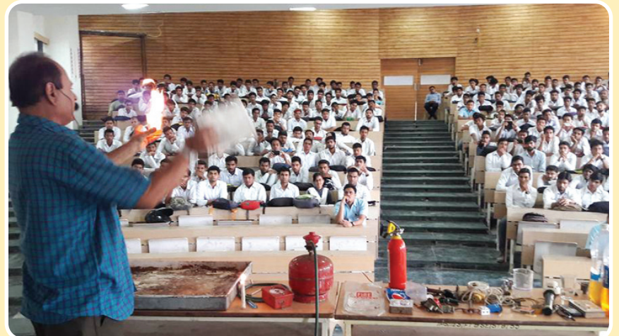
Fire fighter is demonstrating how to control fire. IPS Academy has organized this event.