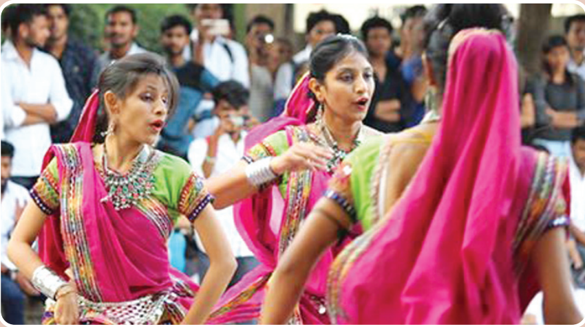
नवरात्रि में आईपीएस एकेडमी कैंपस धर्मिक हो उठा है. नवरात्रि के नौ दिनों तक विद्यार्थियों में उत्साह रहा. एकेडमी में शाम 4 से 6 ( सभी विद्यार्थियों के लिए ) व रात्रि 8 से 10 हॉस्टल गर्ल्स स्टूडेंट्स के लिए गरबा आयोजित किया गया।