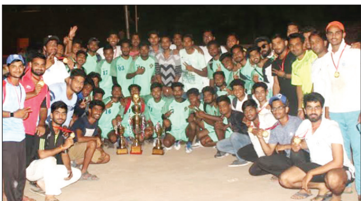
IPSA won overall championship at IIT JODHPUR sports fest 16-17. Also secured WINNING positions in cricket and football alongwith Runners up in Table tennis.

IPSA added many feathers in its cap and excelled in at national level as well as state level tournament. Below is the complete list of the various achievements of IPSA.