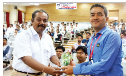
Tech Mahindra Open Campus drive was held at IPSA.