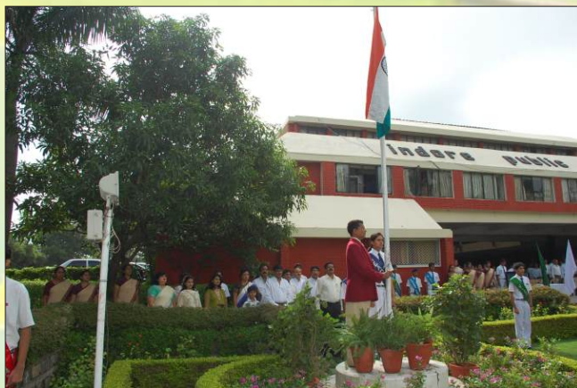
Independence Day celebrated - August 15,2010

Approved by UGC, AICTE, COA, NCTE, PCI,BCI, M.P.Govt. & Affiliated to DAVV Indore, RGPV Bhopal, IKSVV Khairagarh RMSTS&AVV Gwalior, MCRPV Bhopal, YCMOU Nasik Universities.