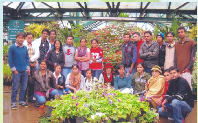
Educational tour of B.A. Travel Tourism Students to Ooty.